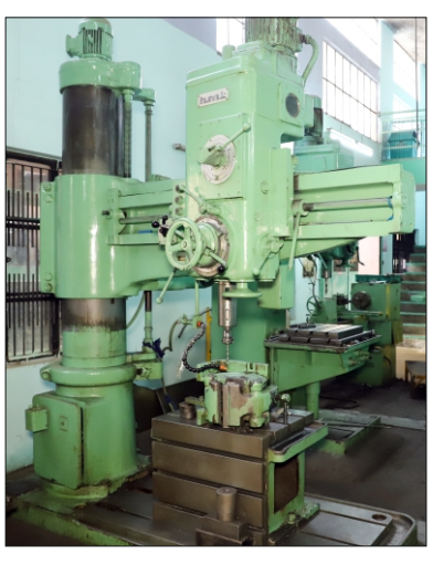
HMT RDM-62 DIA 40 MM