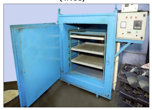
TEMPERING FURNACE 200 KG (2NOS)