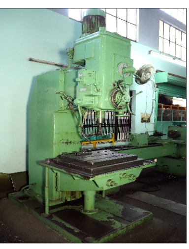
HMT PILLAR DRILL DIA 40 MM (1NOS)