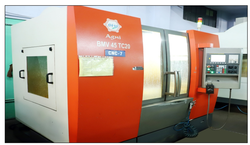
BFW AGNI BMV 45 TC 20 (01 NOS)