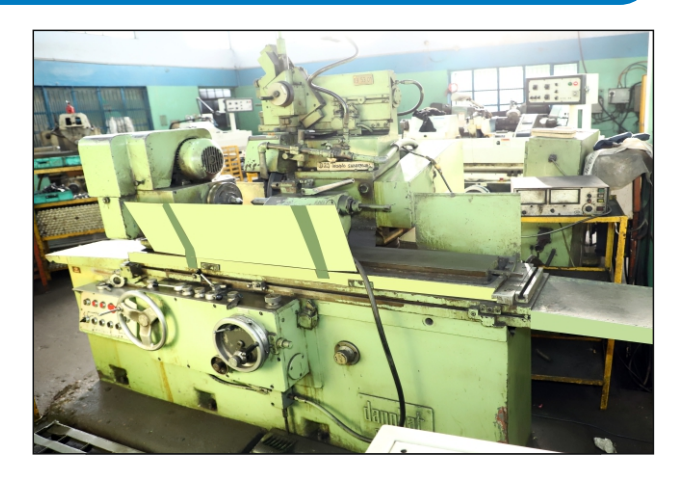
DANOBAT 350 X 800 MM (01 NOS)