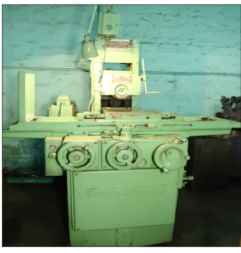
BROWN & SHARP 150 X 350 MM (2 NOS)