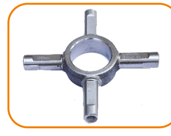
CROSS HARD (SMALL)