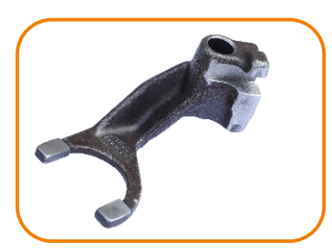
SHIFTER FORK III-IV