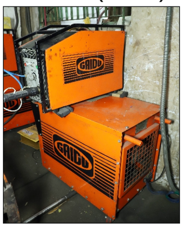
GAIDU MAKE MIG WELDING SETS (02 NOS)