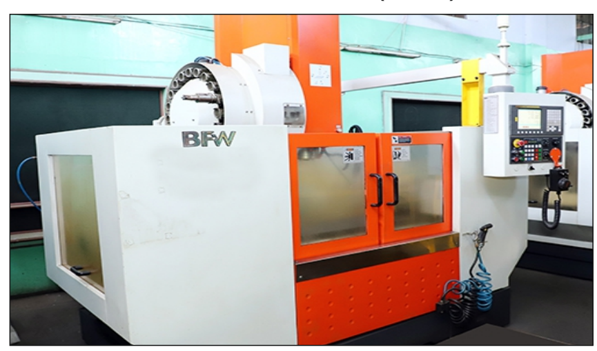
BFW AKSHARA VF 30 (NOS 01)