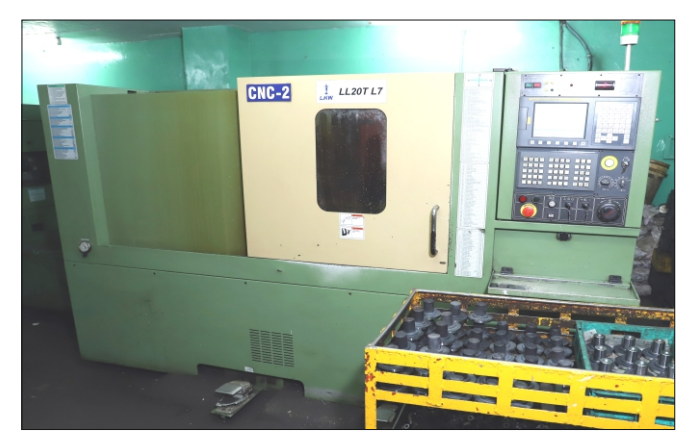
LMW LL 20 T L7 (1NOS)