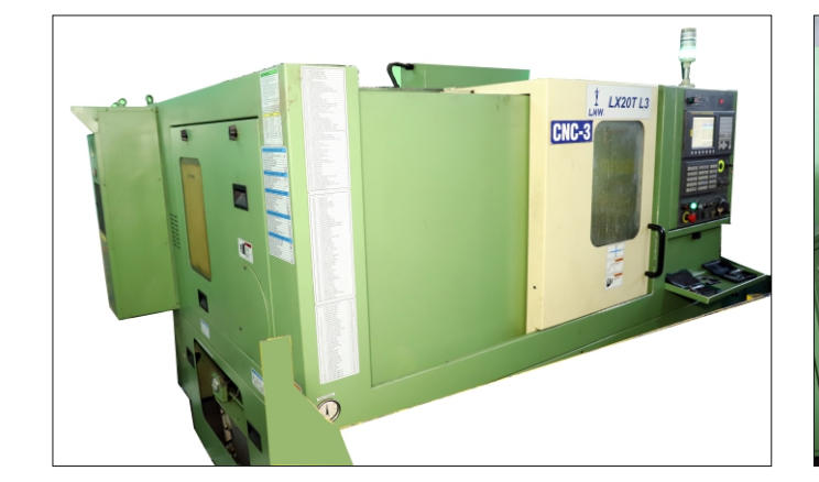
LMW LX 20 T L3 (1NOS)