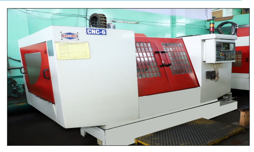
BATLIBOI 75 MC (02 NOS)