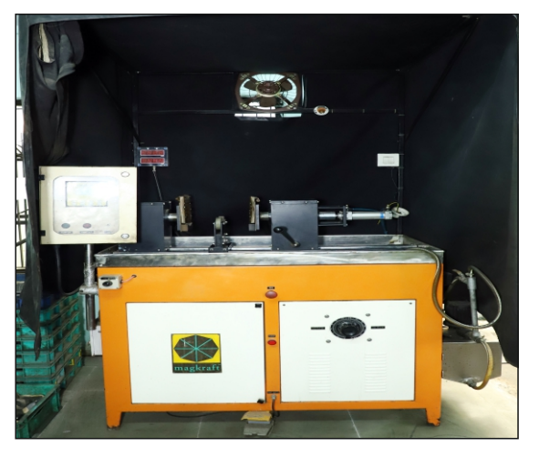
WET TYPE MAGNAFLUX CRACK DETECTION MACHINE (NOS 02)