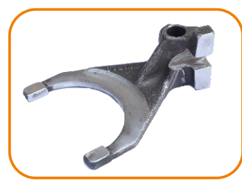
SHIFTER FORK ORCHERD (BIG)