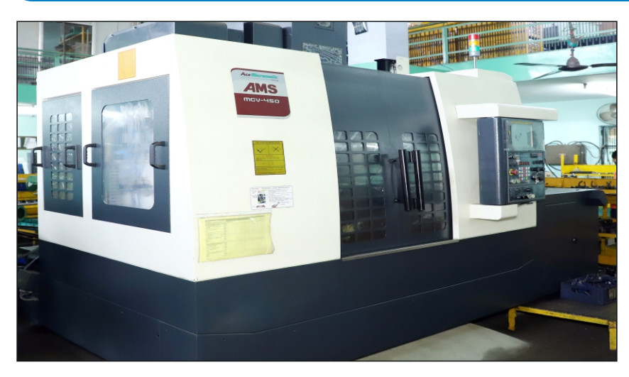
ACE MCV 450 (03 NOS)