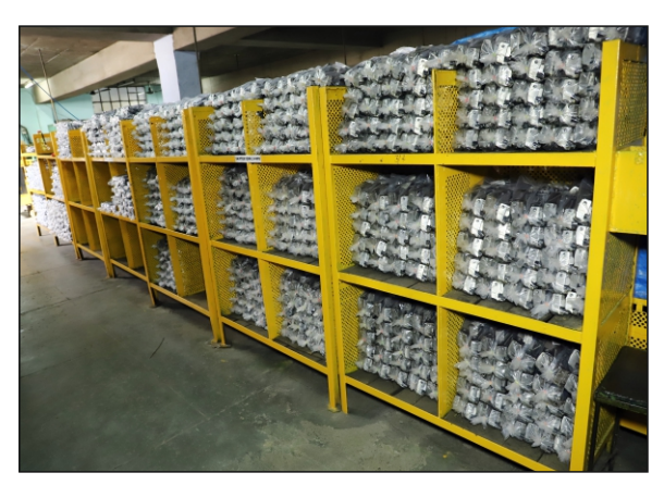
FORK SHIFTERS - FG