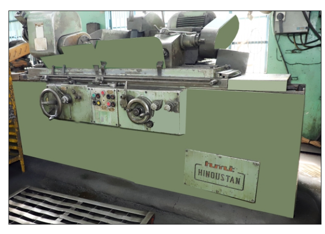
HMT G17 X 800 MM (2 NOS)