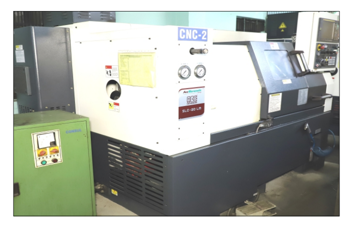
ACE SLC 20 LM (2NOS)