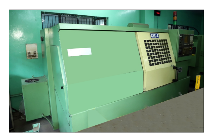
BATLIBOI SPRINT 20TC (5NOS)