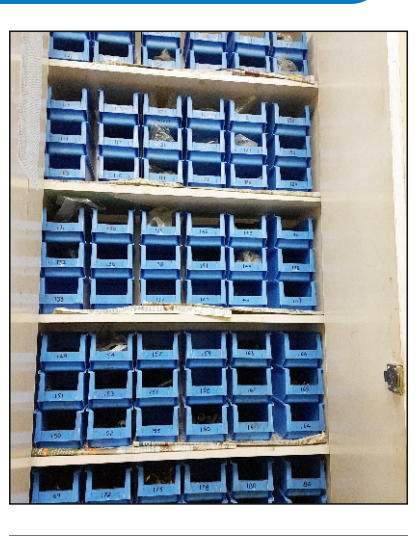
ALL TOOLING STORAGE DESIGNATED