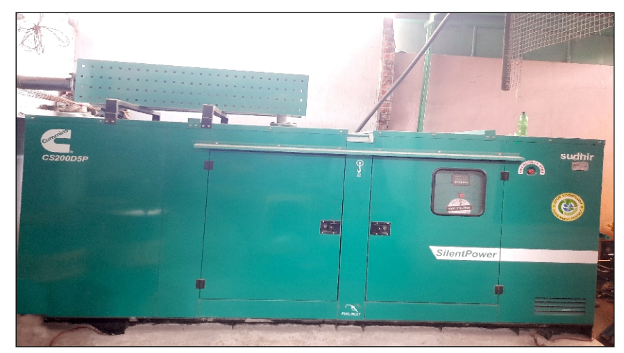
CUMMINS CS200 DSP 200KVA GENSET (NOS 01)