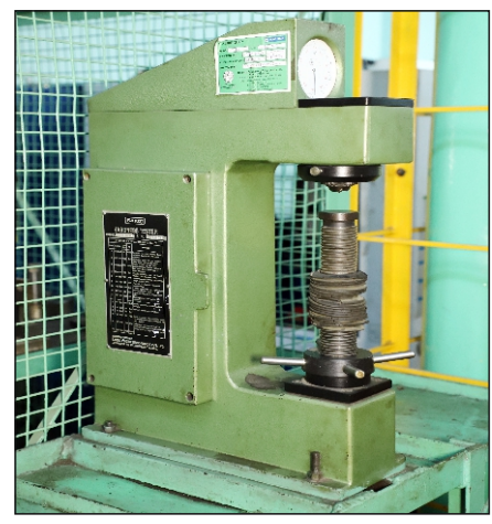
BLUESTAR MAKE ROCKWELL HARDNESS TESTOR (02 NOS)