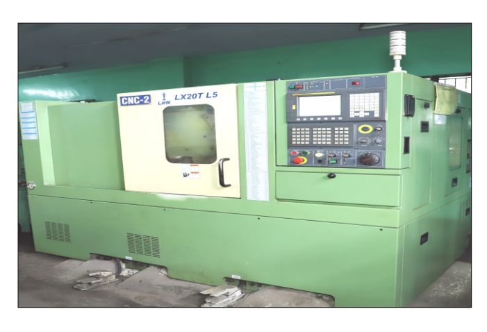
LMW LX 20T L5 (2NOS)