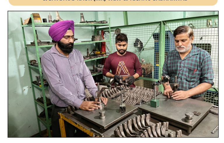
QUALITY CONTROL DEPARTMENT