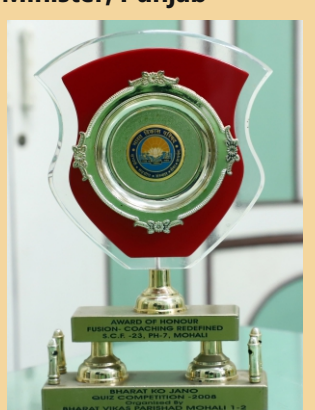
Received Award of Honour from Fusion Coaching Redefined for Quiz Competition in 2005 organized by Bharat Vikas Parisad, Mohali.