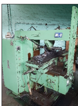
HORIZONTAL MILLING MACHINES OF VARIOUS MAKES (BATLIBOI, HMT, IMPORTED) AND SPECIPFICATIONS (14 NOS)