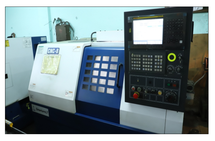
LMW SMART TURN LT (3 NOS)