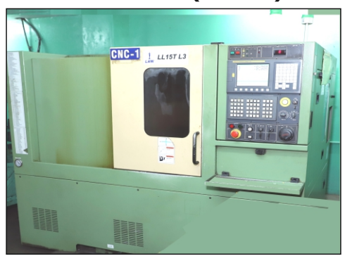
LMW LL 15 T L3 (1NOS)