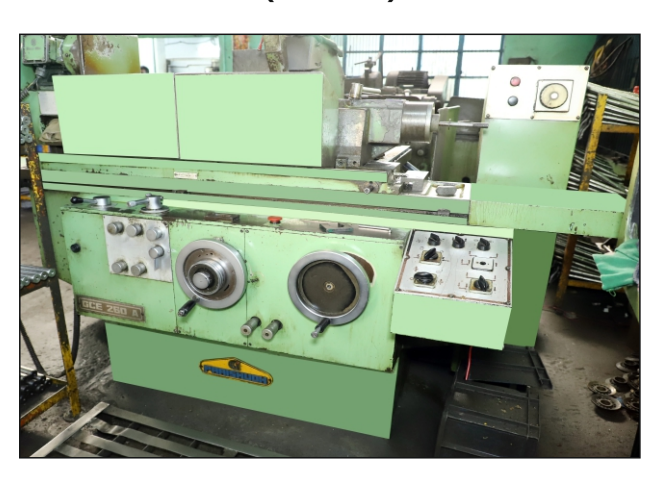
PARISHUD GCE 260 X 600 MM (01 NOS)