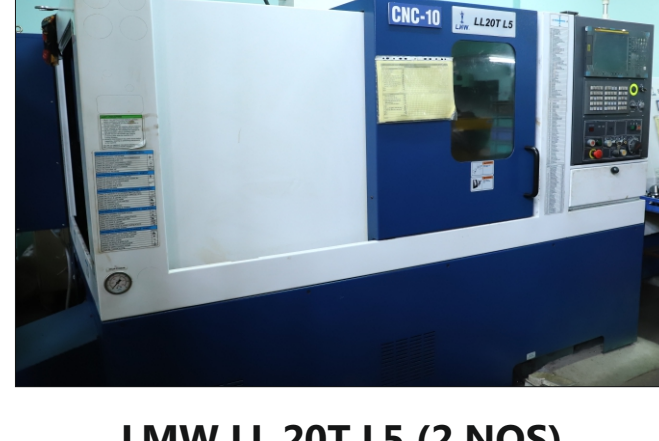
LMW LL 20T L5 (2 NOS)