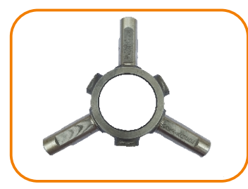
CROSS (3 ARMS)