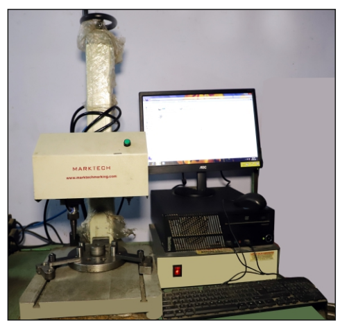
CNC ENGRAVING MACHINE (02 NOS)