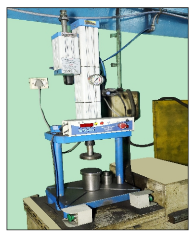
MERCURY PNEUMATIC PRESS 3 T (01 NOS)