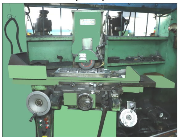
PRAGA MAKE 200 X 600 MM (1 NOS)