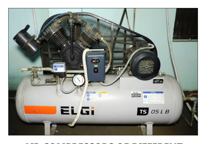
AIR COMPRESSORS OF DIFFERENT CAPACITY (12 NOS)