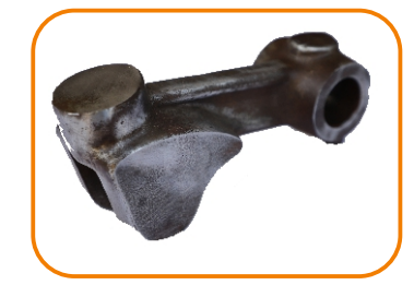
VALVE LEVERLIFTER PUSH ROD SEMI FINISHED