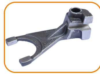
SHIFTER FORK ORCHERD (SMALL)