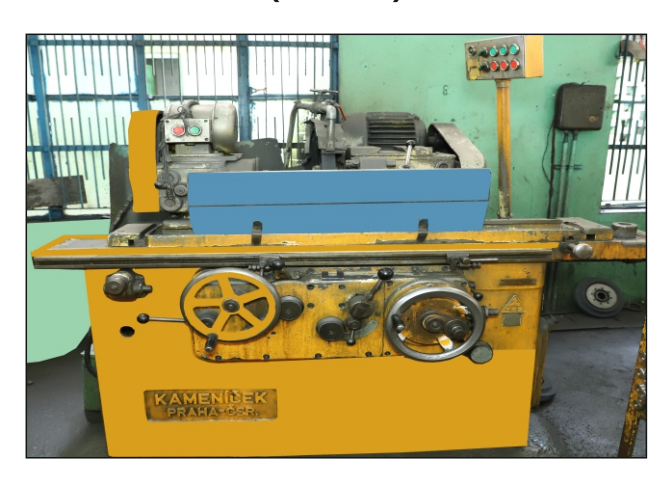
TOS KAMENICEK 260 X 600 MM (01 NOS)