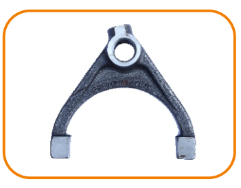
SHIFTER FORK II III XM