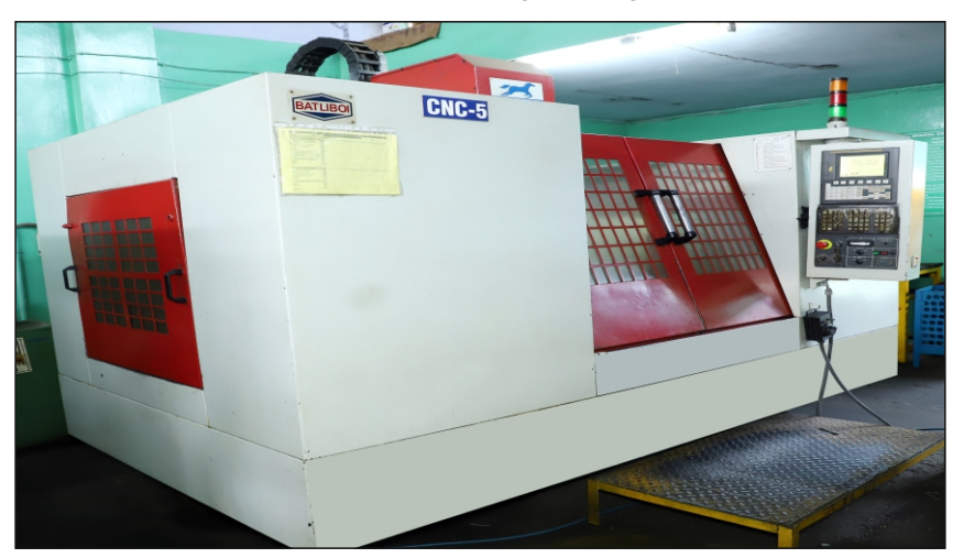
BATLIBOI CHETAK 100 MC (01 NOS)