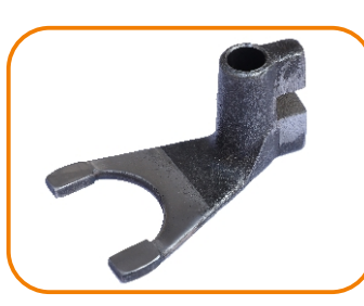
SHIFTER FORK II