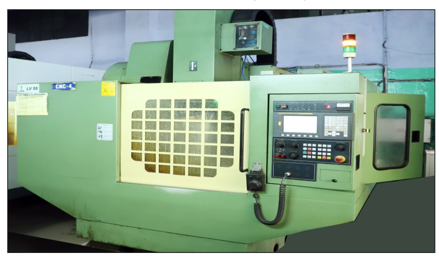
LMW LV 55 (01 NOS)