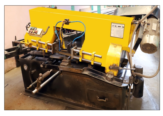
HYDRAULIC BANDSAW HEXA (4NOS)