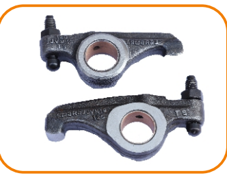
ROCKER LEVER ASSY