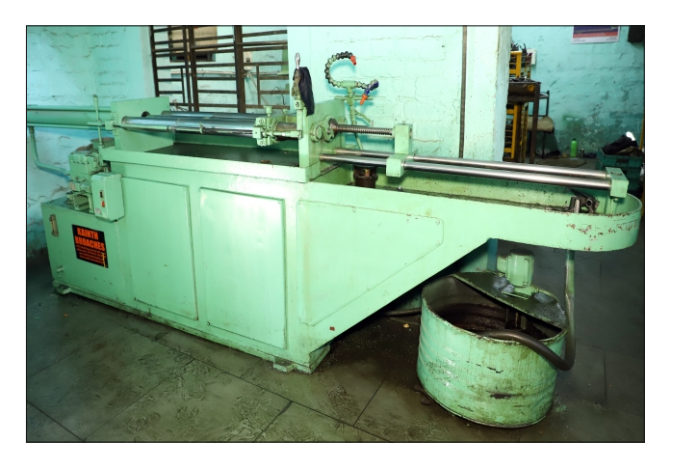
HORIZONTAL HYDRAULIC BROACHING MACHINE 10 T (06 NOS)