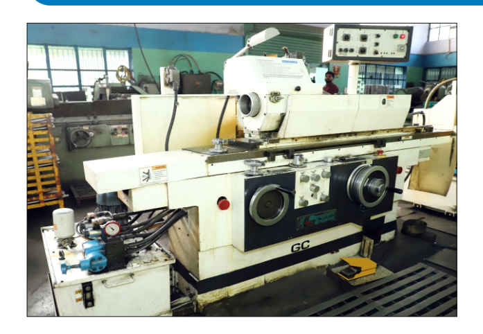
ACE MICROMATIC GCE 260 X 600 MM (2 NOS)