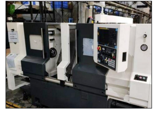
ACE CNC CHUCKER (SLC-16LM DOUBLE SPINDLE) (1NOS)