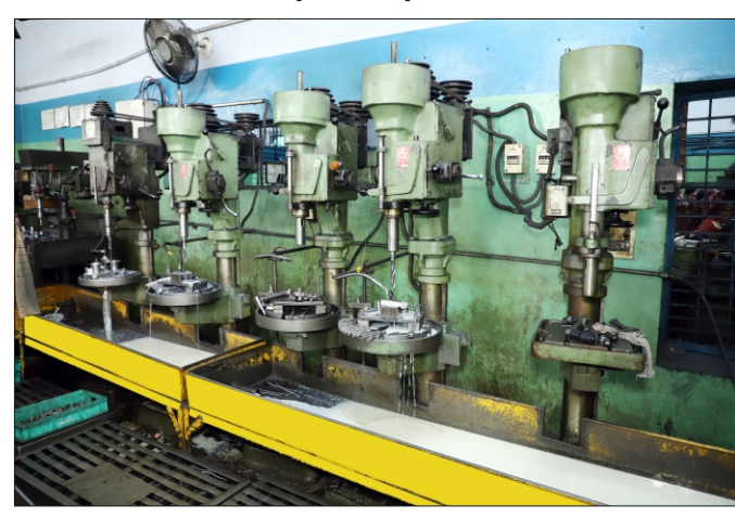
FIFCO MAKE PILLAR DRILL DIA 25 MM (5 NOS)