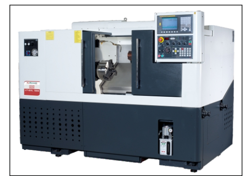
ACE CNC JOBBER XL SPINDLE MT-5 TAPER (2NOS)