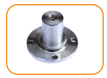
SUPPORT FOR INTERMIDEATE GEAR