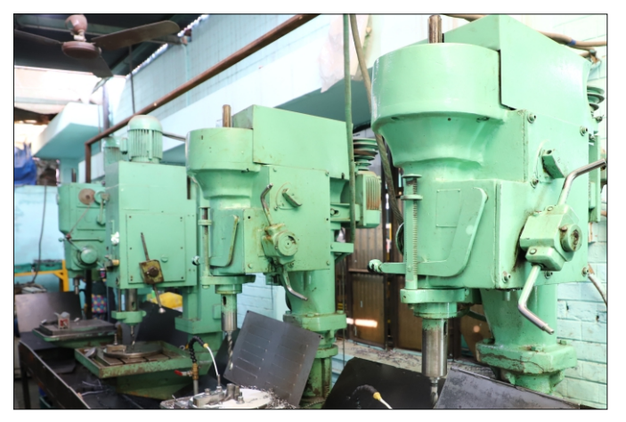
PILLAR DRILL MACHINE ( )MM (4 NOS)