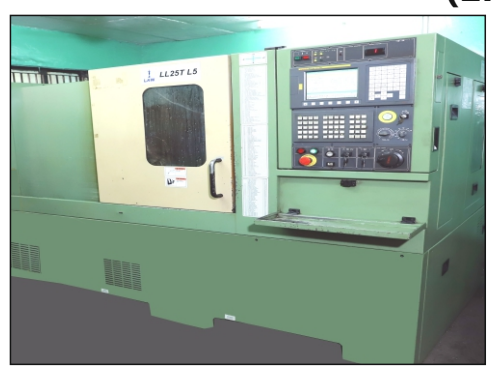
LMW LL 25 T L5 (1NOS)