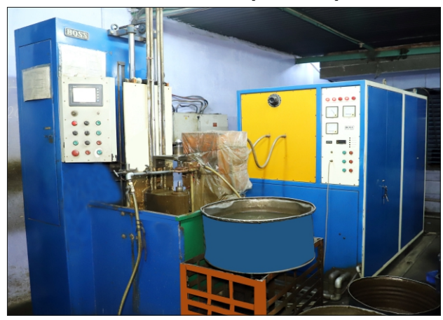
BOSS MAKE PLC CONTROLLED 60 KW INDUCTION HARDENING SETUP (NOS 2)