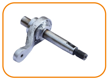
THROTTLE SHAFT ASSY