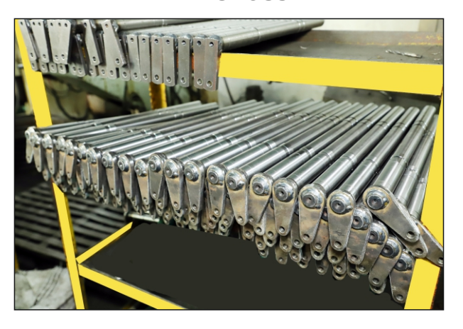
WIP - BP SHAFTS