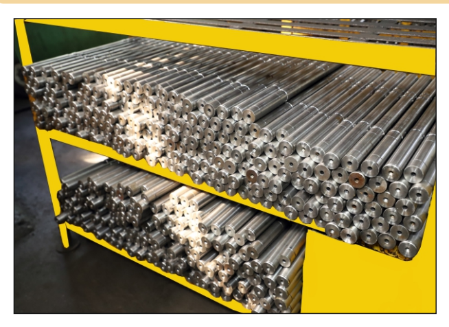
WIP - CA SHAFT