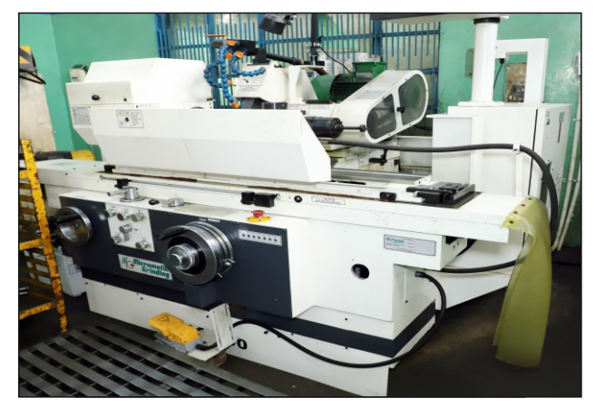
ACE MICROMATIC GCE 350 X 600 MM (03 NOS)