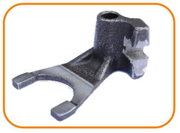
SHIFTER FORK IST REVERSE