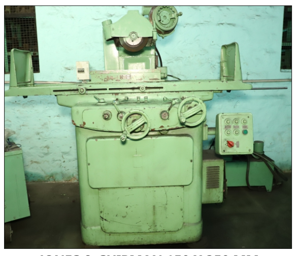
JONES & SHIPMAN 150 X 350 MM (1 NOS)