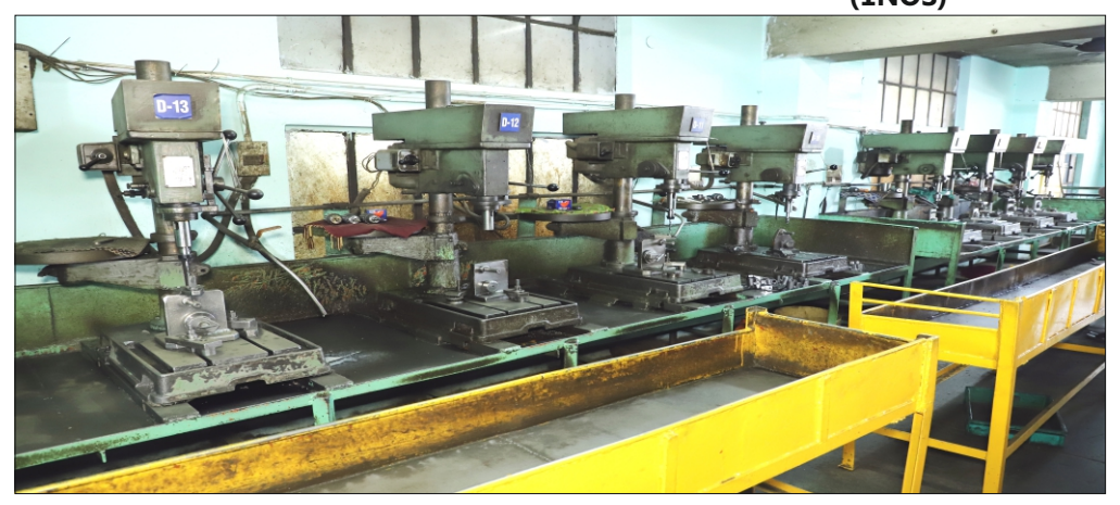
FIFCO MAKE BENCH DRILL DIA 16 MM (22 NOS)