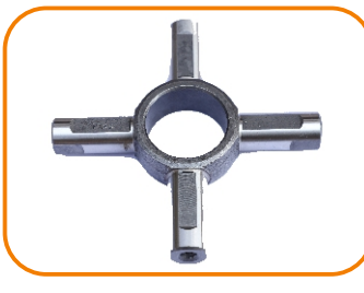
CROSS HARD (BIG)