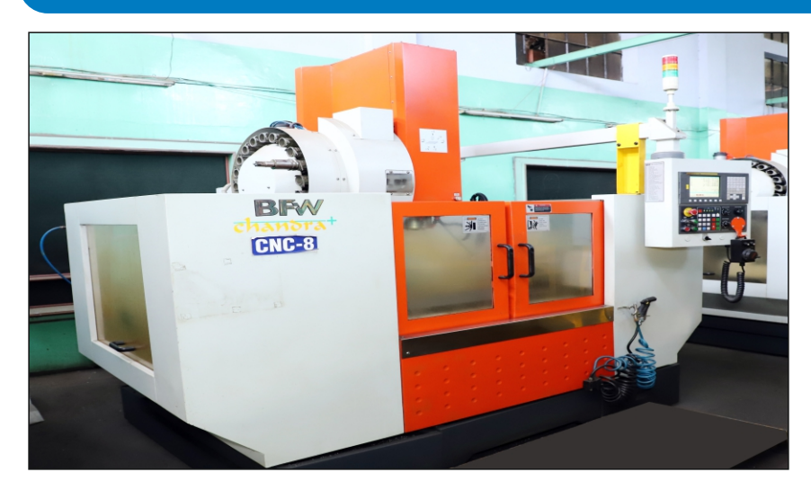
BFW CHANDRA + (05 NOS)