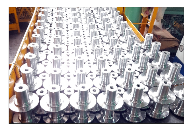
WIP - SUPPORTS