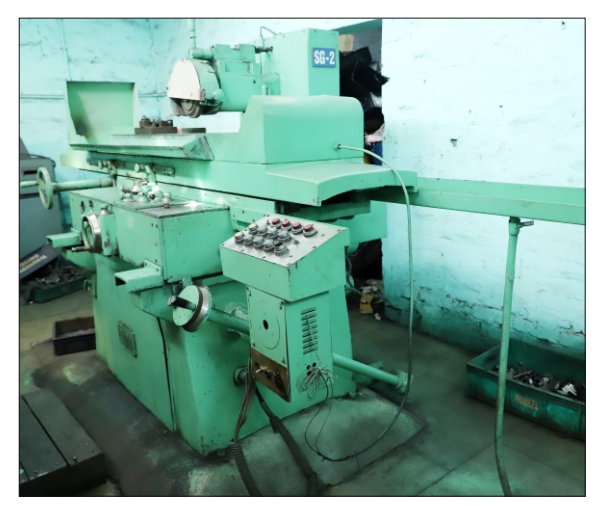
AVRO MAKE 300 X 1000MM (1 NOS)