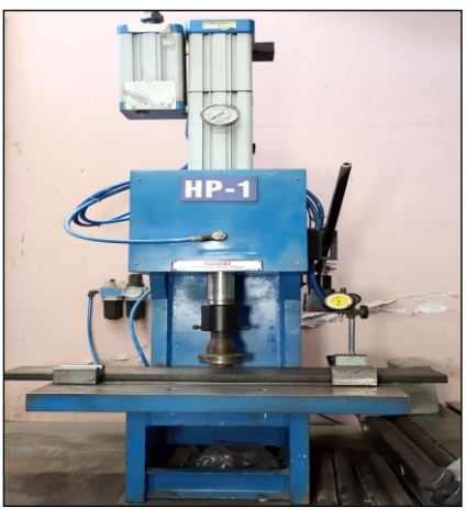
HYDRO PNEUMATIC PRESS 8 T (01 NOS)